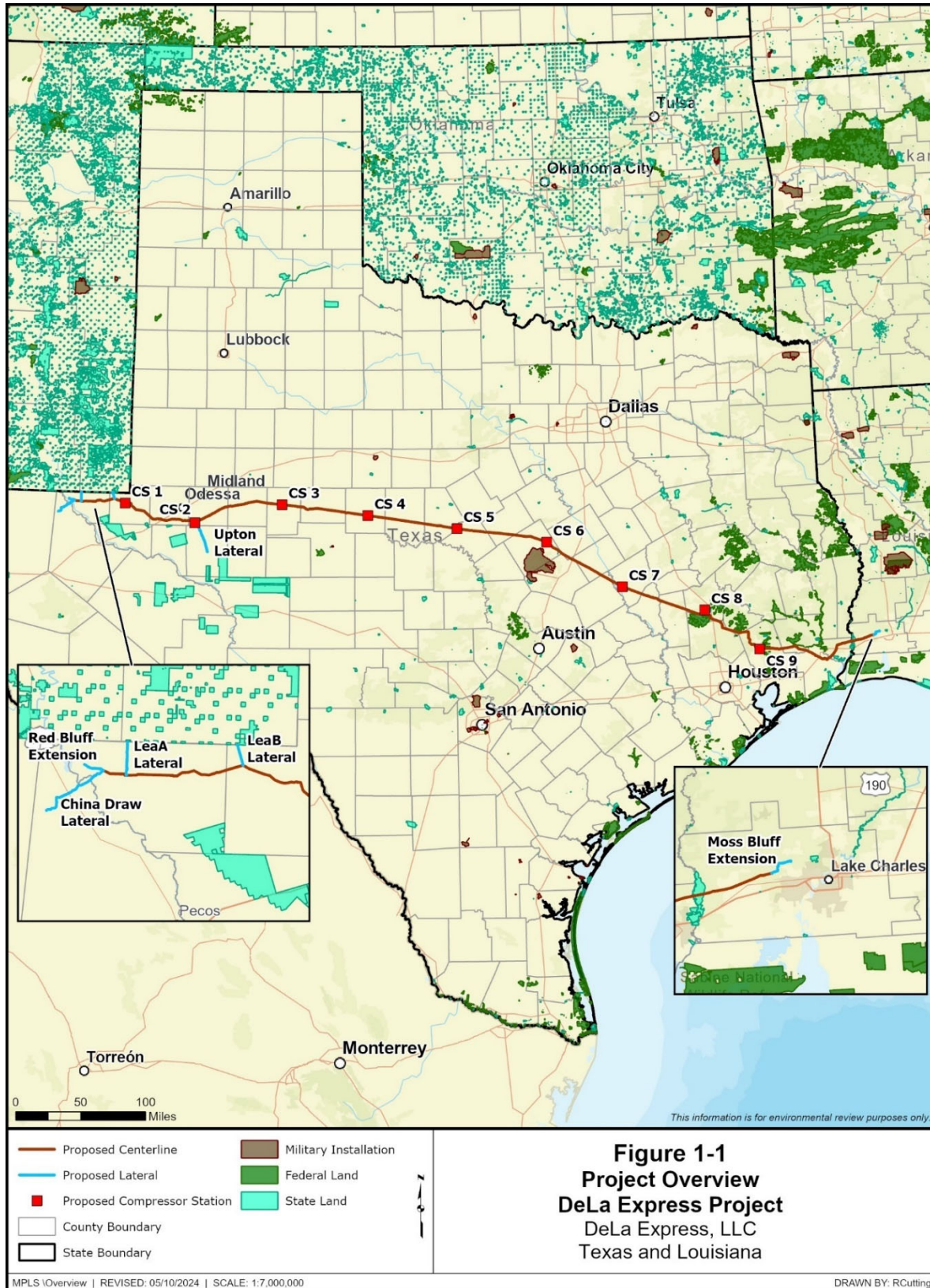
Figure 1-1: Project Overview Map